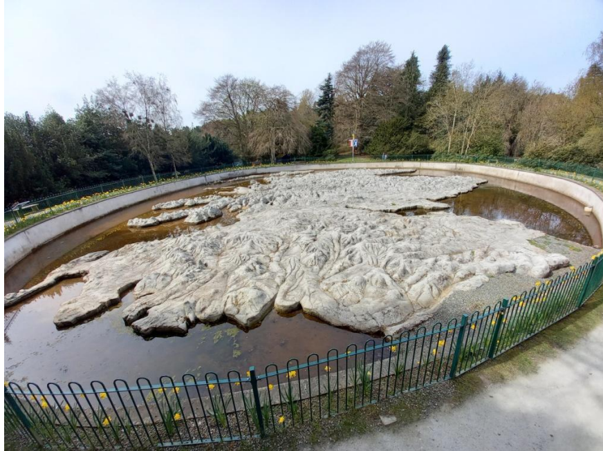
Wide-angle view of daffodils around Map by Jennifer Sherry